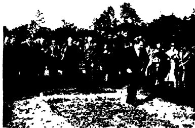
Kuda Bux's feet being medically examined by physician immediately before first trial at final fire-walk, September 17, 1935